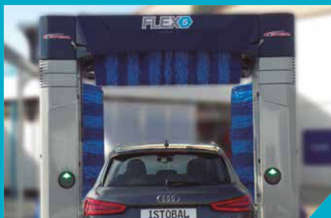
FLEX5 with 3 brushes